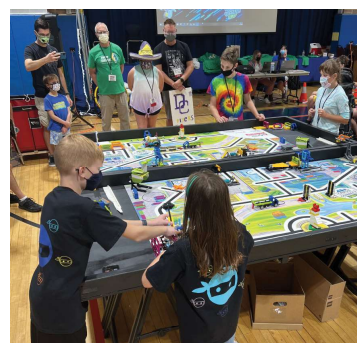
Team Code Ninjas vs Team DC Flyers at the competition table