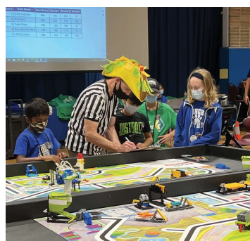
Team from Springboro scoring their match with the referee