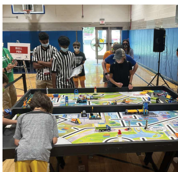
FTC Team Quantum Leap refereeing the robot game competition