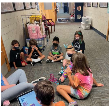
Team Code Ninjas practicing for judging