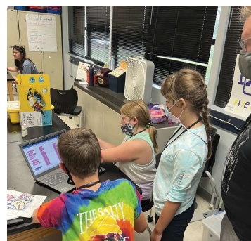
Team from Dayton Christian programming their robot