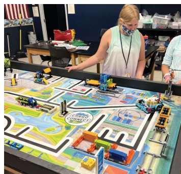
Team from Dayton Christian testing their programs