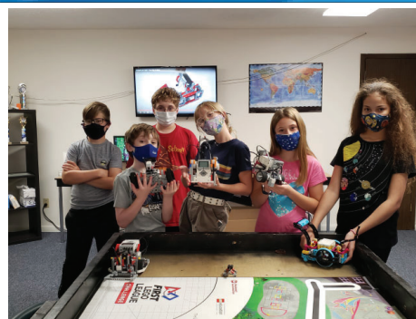
Team Spaghetti Slurpers from Northeast Ohio (right)