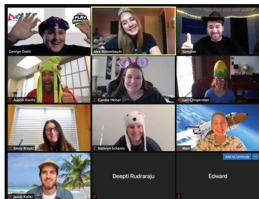
FIRST alumni turned out in force to judge for the Scarlet & Gray qualifier (right)