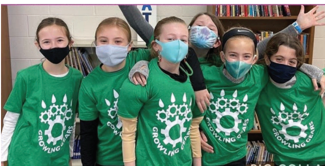
Team Growling Gears from Cincinnati (left)