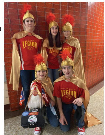
2751 Lego Legion (Cincinnati)

Each year, FIRST® LEGO League teams from around the globe compete for the Global Innovation Award. This award recognizes the teams with the most innovative solutions to the season's themed project that requires teams to research a real-world problem and propose an innovative solution to the problem. This season, called RePLAY, tasked teams with identifying problems associated with people not being active enough and attempt to solve the identified problem. The teams who make it into the Global Innovation Award contest are teams with highly innovative and often patent-worthy solutions. Three teams from Ohio have made it into the Global Innovation Award Semi-Finals!