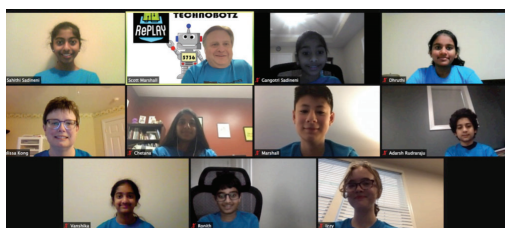
5736 Techno Bots