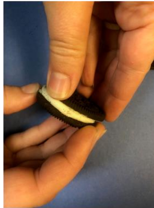
Step 2 a: